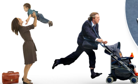
Ketchikan Parents with Kids Under 6 1