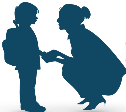
Juneau Parents with Kids Under 6 2